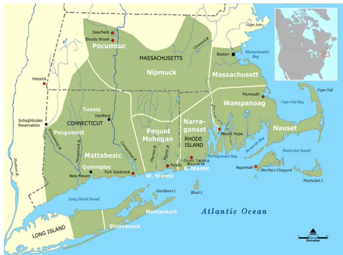
The Wampanoag Confederacy

After fleeing religious persecution in England, and first settling in Leiden, The Netherlands, where they discovered that they did not care for the Dutch culture, the Pilgrims set sail for America in the hope that they could freely practice their Puritan beliefs. As you all know, they landed at Plymouth in the Patuxet region on the eastern shore of present-day Massachusetts. Patuxet was the homeland of the Wampanoag Confederacy. Wampanoag means " People of the First Light. " which makes sense since they would be the first to see the sun rise over the Atlantic Ocean. The Confederacy was led by Chief Massasoit, head of the Pokanoket tribe.