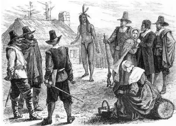
Samoset Contacts the Pilgrims - 1621

So it was a surprise to the Pilgrims when, on 16 Mar 1621, Samoset walked into their settlement and in broken English, said "Welcome, Englishmen, Welcome!" Samoset, whose name means " He Who Walks Over Much, " was born about 1590 on Monhegan Island, a small, rocky island off the coast of present-day Maine. He was a sagamore, or lesser chief, of the Eastern Abenaki people who ranged from east of the White Mountains in present-day New Hampshire to the southeast coastline of Maine. Abenaki means " People of the Eastern Dawn. " Samoset told the Pilgrims he had arrived in Patuxet in Jul 1620, that he had been visiting Chief Massasoit, and had come to the settlement as an emissary.